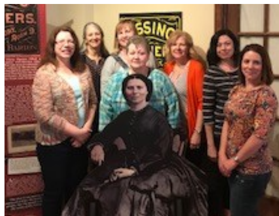
Clara Barton Missing Solider