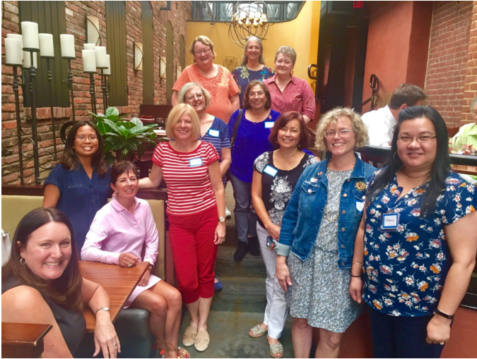
First Lunch Bunch outing to Columbia Firehouse .